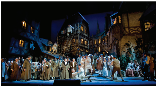
A scene from our majestic 2010 production of Die Meistersinger von Nürnberg .